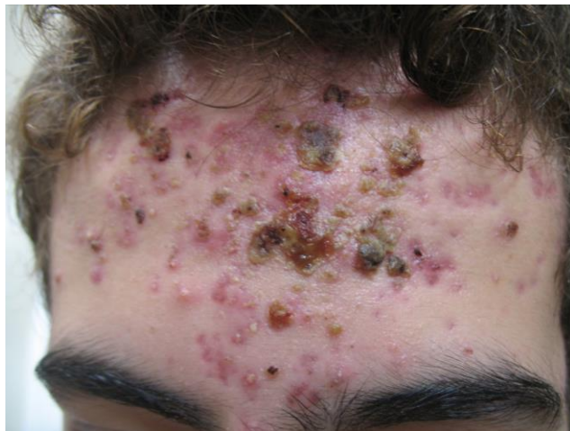
11-year-old male with rapid onset over the prior three months (9-18-2013)