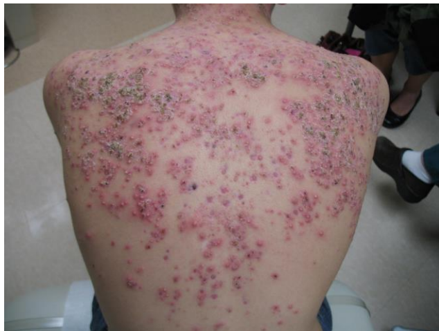
CRP = 3.5