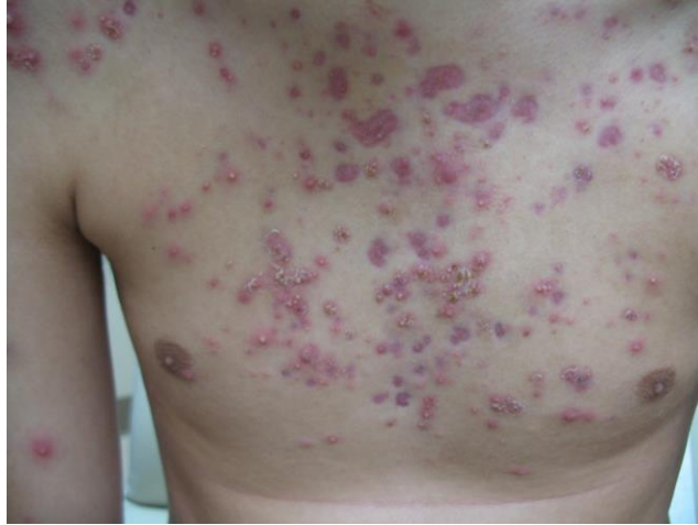
He began to flare after the prednisone was stopped and presented with fever and joint pain