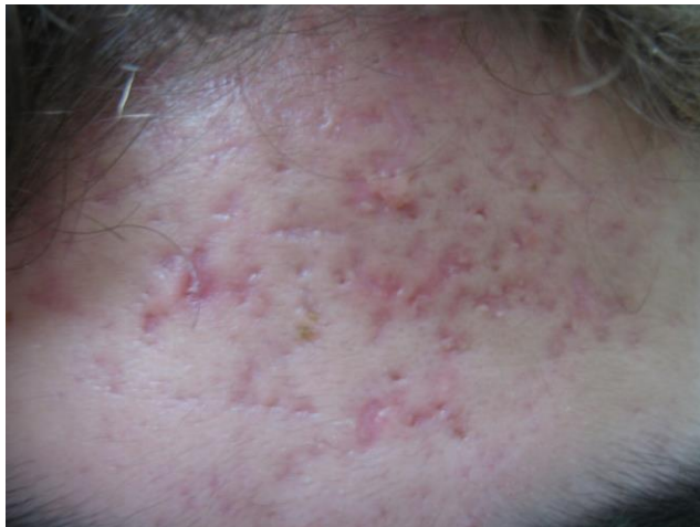
When he reached 10mg of prednisone daily his mom notes he started to "feel bad" again.